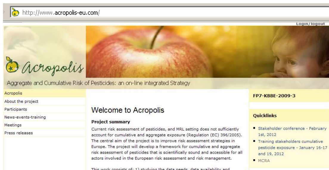
Figure 1. Public part of the Acropolis website

On the public part of the website (Figure 1) you can find on the left hand side a menu. By clicking on one of the menu items, detailed information on this item will appear on the main part of the page. The menu items will be extended during the project if needed.