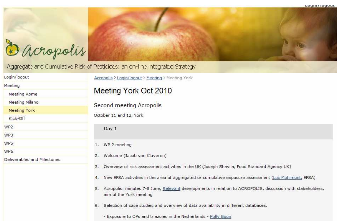
Figure 3. Content of the restricted part of the ACROPOLIS website

The restricted part of the ACROPOLIS website looks the same as the public part (Figure 3). This part contains background and working documents which are only meant for the partners of the project. On this part the menu items will also be extended during the course of project.